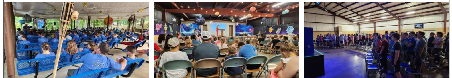
Youth Camp Worship